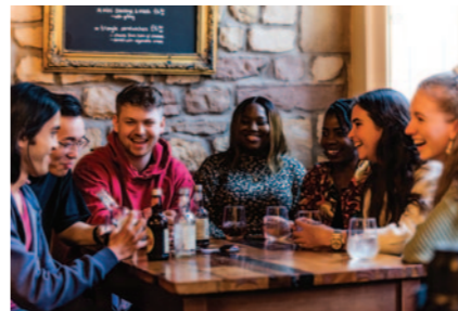
The Sun Inn