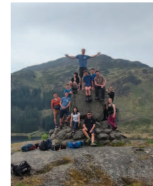
Lancaster University Hiking Club

The countryside surrounding Lancaster has inspired some of the world's most renowned artists, poets and explorers and we're sure it will inspire you too. Lancaster sits on the edge of the Trough of Bowland. Steeped in history, it holds many of the secrets of the Pendle Witches - the namesake of one of our colleges. A little further is the Lake District National Park, a popular world heritage site. Believe us, it's worth the trip.