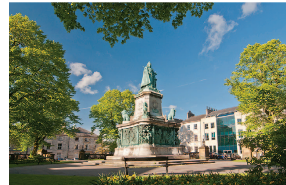
Queen Victoria Memorial, Dalton Square