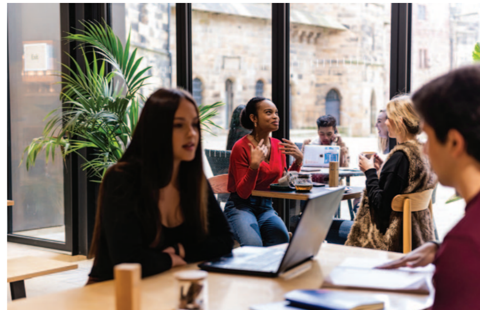
Atkinsons café at the castle

"The Storey or Atkinsons has the best coffee. My favourite place for brunch is Journey Social."