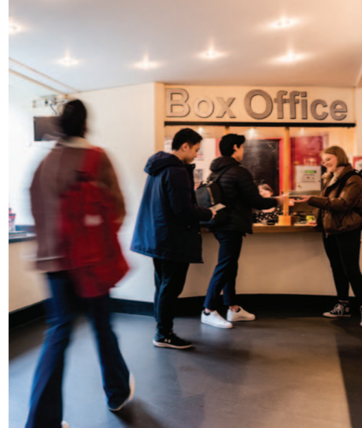
The Dukes Theatre

"A night out for me and my mates would be Squires - the pool and snooker hall in Lancaster. Then we like the student nightclub, Sugar."