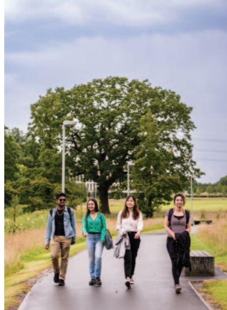
Walking routes to campus