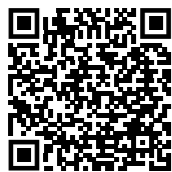
scan for cycling info