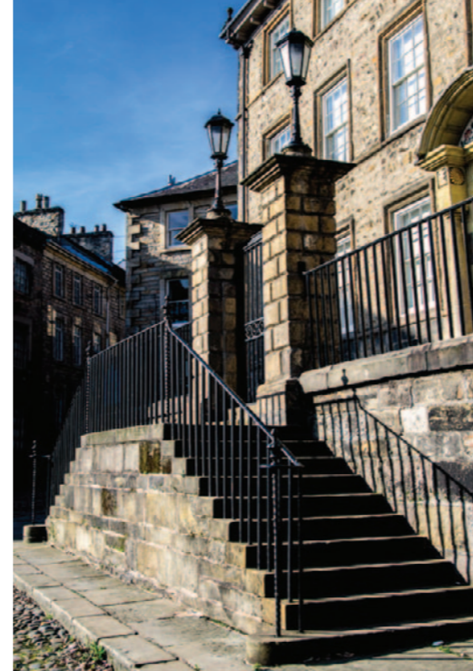
The Judge's Lodging