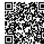
scan for bus info

Bus is the most popular way to travel between the city and uni, with over 14 buses an hour during the day in term time and discounted passes available. There's also a choice of scenic off-road walking and cycling routes - the city is only 20 minutes away by bike or about an hour walking. If you prefer the convenience of a taxi, there's two taxi ranks on campus.