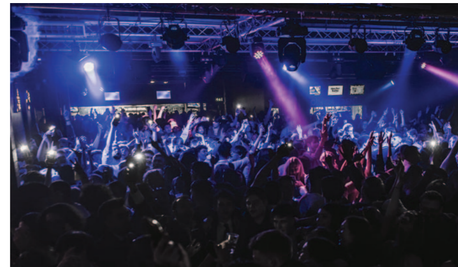
The student union club, Sugar