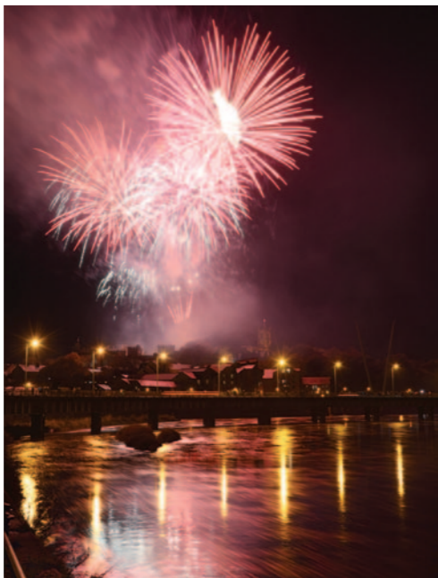
Fireworks with Light up Lancaster