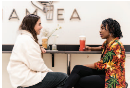
Bubble tea at Tiam Tea café

For more information, please visit lancaster.ac.uk