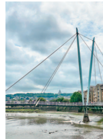
Lune Millennium Bridge, part of the National Cycle Network

"The buses into town are really easy and run late into the night. There are even night buses on the weekend to get back from a night out."