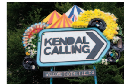
Kendal Calling Festival