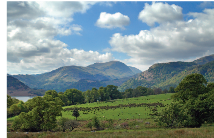
Ullswater, the Lake District