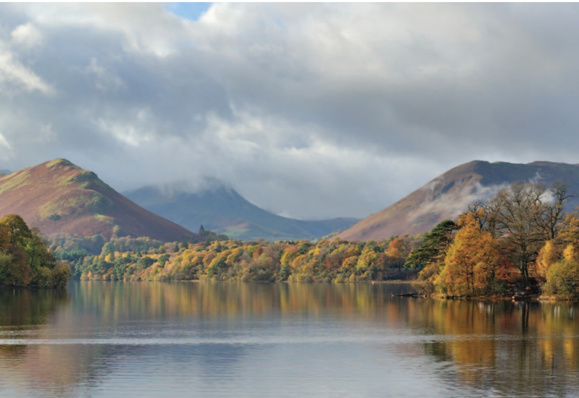
Catbells on Derwent Water, the Lake District