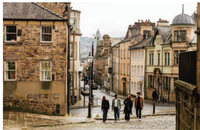
Cobbled streets and Georgian architecture

"Lancaster was the perfect city for me mainly because it's rather small compared to other cities, and hence a lot less scary for someone trying to get their bearings, yet there is still a lot to do."