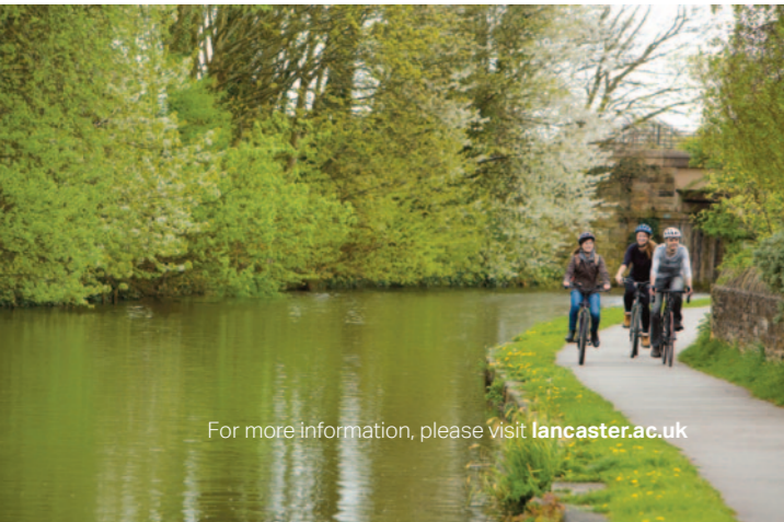
For more information, please visit lancaster.ac.uk