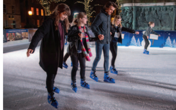
Ice skating at Dalton Square