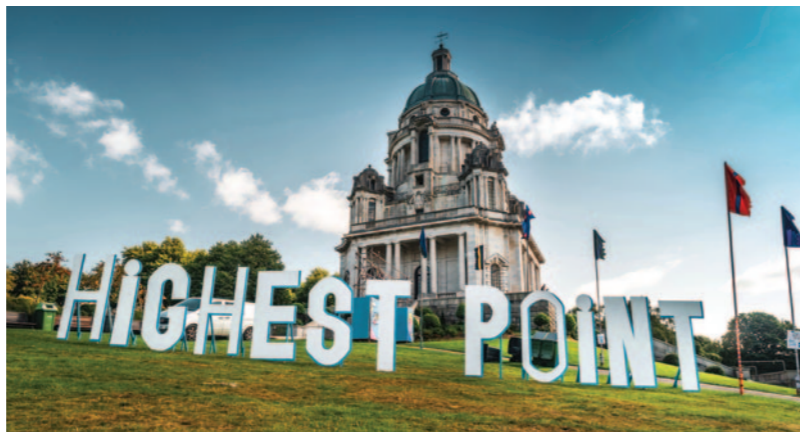
Highest Point Festival at Williamson Park