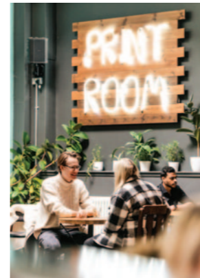
The Print Room café

Lancaster's coffee quarter has a long history; our primary roaster opened its doors in 1837. Alongside are a host of cafés depending on your mood. Relax in the vegan oasis of Herbarium, keep it cosy in Brew or hit some familiar favourites like Starbucks or Caffé Nero. Many cafés open late into the evening and offer space for music, comedy, gaming and more.