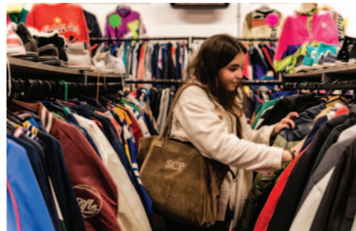
Vintage clothes shopping at the Assembly Rooms

For more information, please visit lancaster.ac.uk