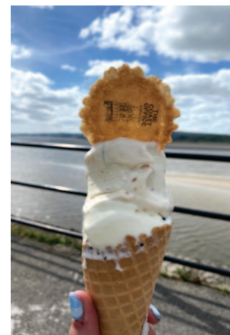
Ice cream at Arnside

"I like Morecambe because there is a beach and you can watch beautiful sunsets over the sea." Fuk Ching Wong, Graduate College