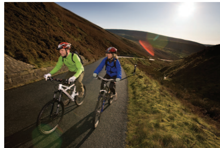
Trough of Bowland