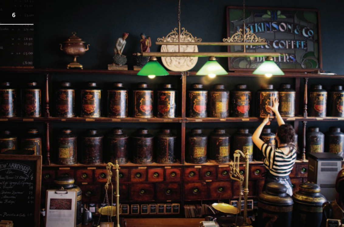
Atkinsons coffee roasters

"I love to stay in one of the cafés and write or read for the entire day. A lot of the cafés are amazing and really comfortable."