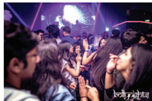
Bollywood night at Vibe nightclub and bar

For more information, please visit lancaster.ac.uk