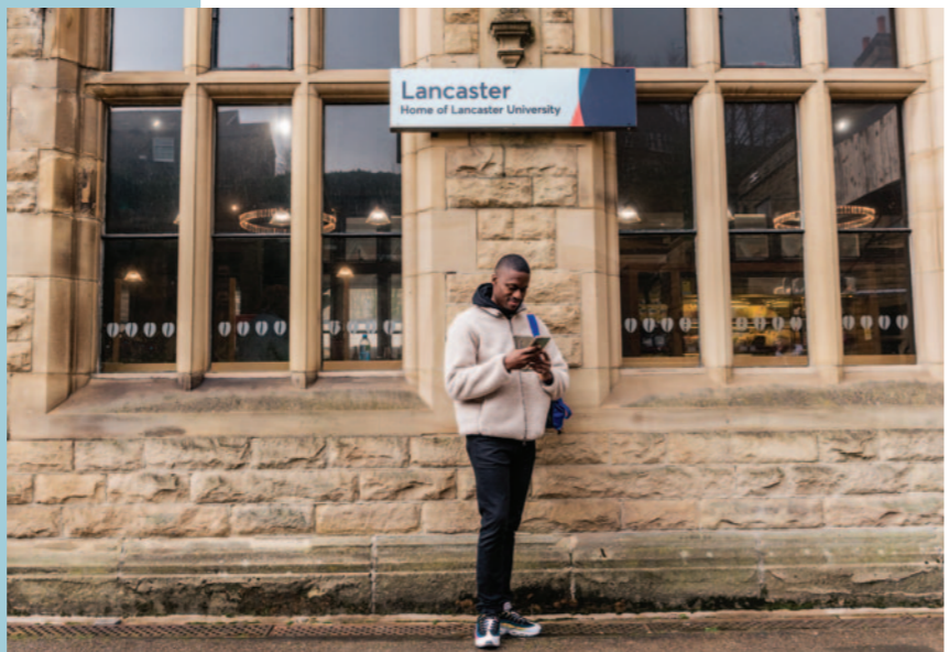
Lancaster Train Station is on the West Coast Main Line which connects London to Scotland

For more information, please visit lancaster.ac.uk