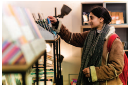
Unique stationery at Analog

For more information, please visit lancaster.ac.uk