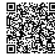
scan for video