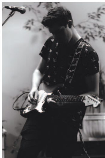
Lancaster Music Festival