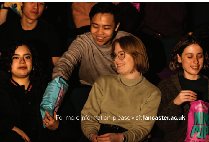
An evening at the cinema

For more information, please visit lancaster.ac.uk