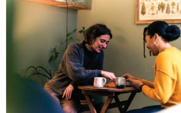
The Herbarium café