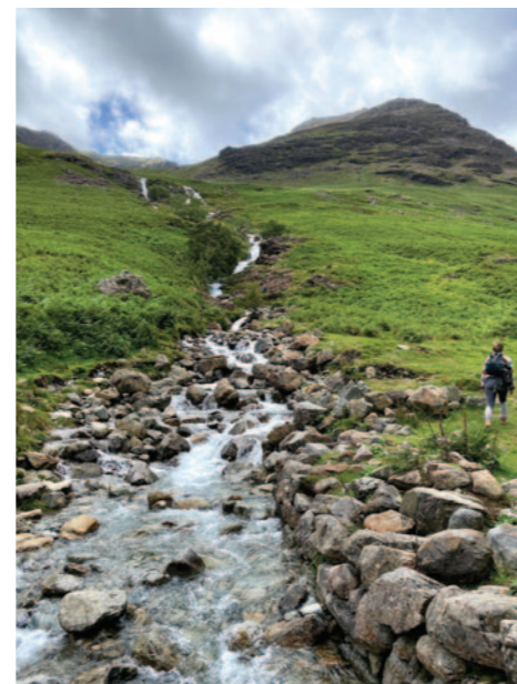
Buttermere, the Lake District