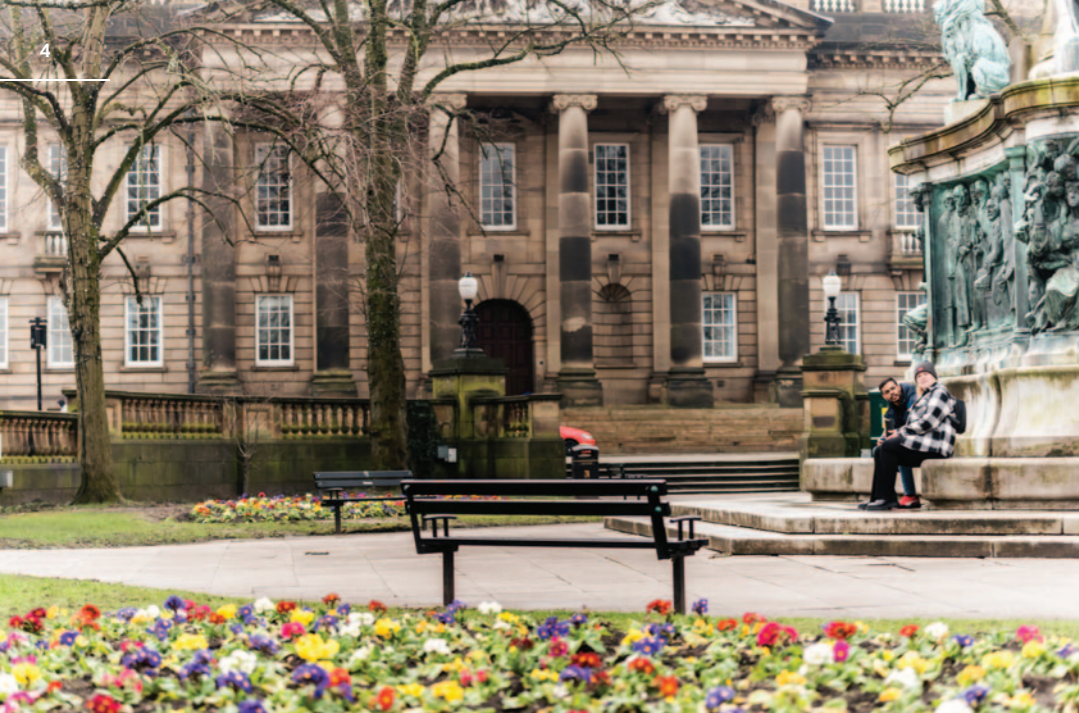
Lancaster Town Hall overlooking Dalton Square