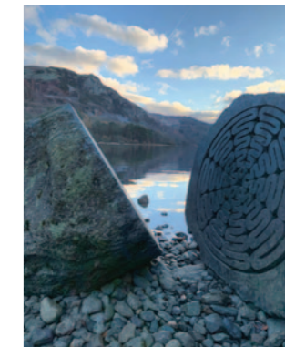
Derwent Water, the Lake District