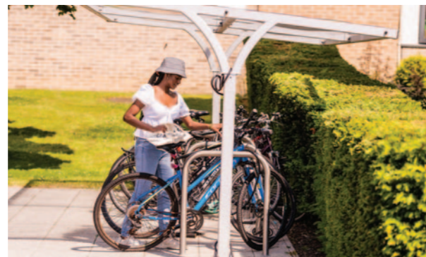
Cycle stands are available across campus and most colleges have secure cycle stores