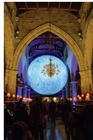
Installations at Light up Lancaster