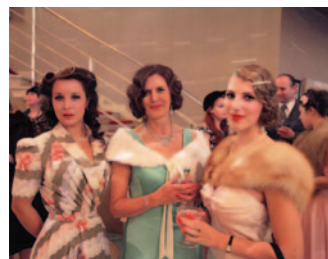
Vintage by the Sea festival

There's big festival energy right on your doorstep. Make the most of your weekends with the region's largest open air music festival, Highest Point, or try something different at the kitsch filled Vintage by the Sea in nearby Morecambe.