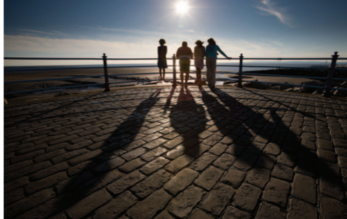
Sunsets over Morecambe Bay