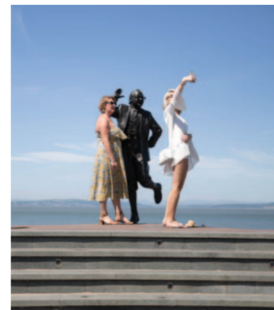
The Eric Morecambe statue, Morecambe Bay