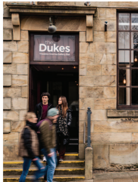
The Dukes Theatre and café bar

For more information, please visit lancaster.ac.uk