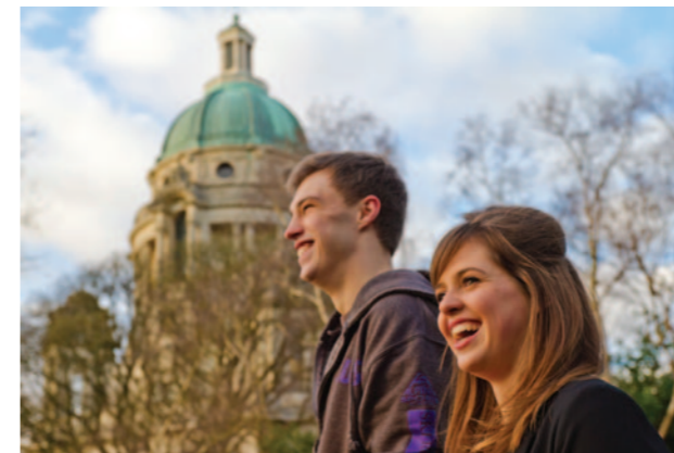
Ashton Memorial, Williamson Park

The City of Lancaster is a wonderful neighbour to campus. Its fascinating heritage and stunning architecture give student life an impressive setting. Whilst Lancaster Castle and the Ashton Memorial dominate the city's skyline, traditional cobbled streets and secret lanes offer old world character to explore.