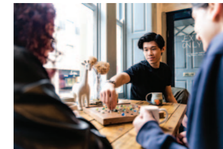
The Herbarium café