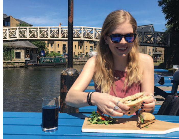
The Waterwitch pub