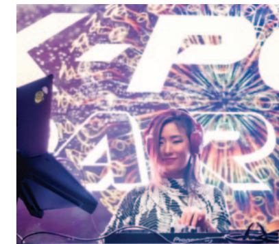
K-Pop night at Vibe nightclub and bar