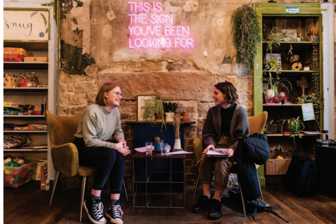
The Herbarium café is open late on Fridays

We might be smaller than some cities, but Lancaster makes up for its size with variety. Nightlife is no exception. Late night cafés, arts spaces, music venues and pop up spaces can be found alongside pubs, clubs and bars to suit every vibe.