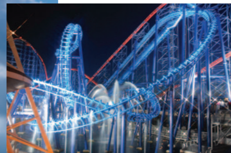
Blackpool Pleasure Beach