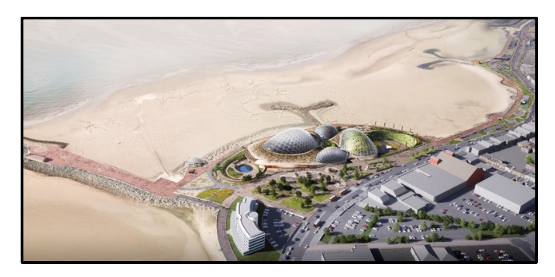
Figure 2 - Proposed Eden Project Morecambe Site