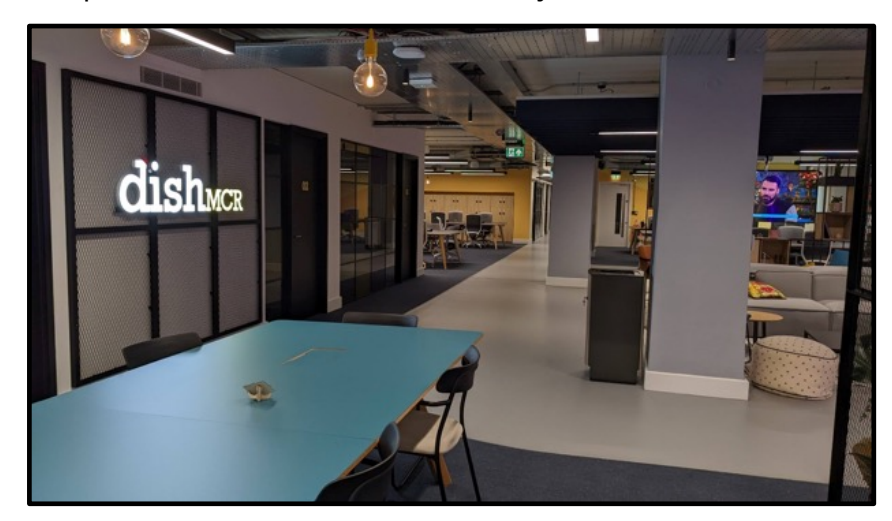
Figure 3 - Collaborative Working Space at the DiSH

The <u>Lancashire Cyber Alliance</u> was recently launched, supported by the LEP and Digital Skills Partnership. It is a spoke of the North West Cyber Security Cluster (<u>NWCSC</u>), which provides a voice for the region and is affiliated with the UK Cyber Cluster Collaboration (UKC3). It is the ambition of Lancaster and partners to create a North West "cyber corridor" from Manchester to Lancaster and beyond.