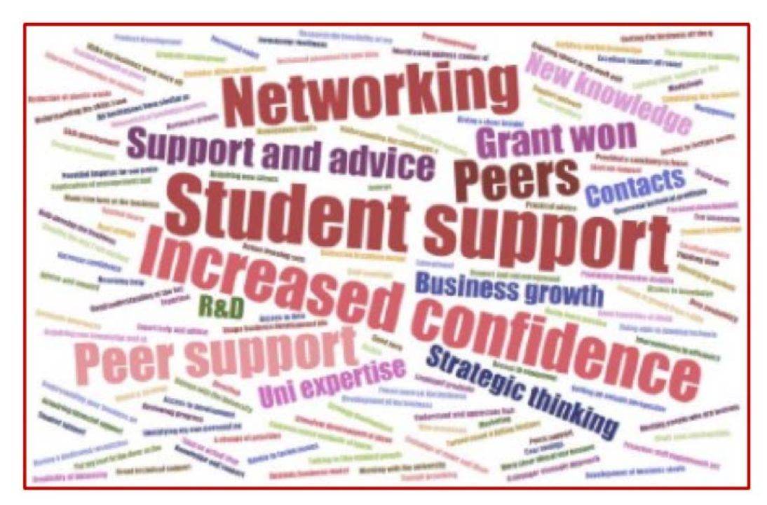
Figure 4 - Impacts Reported by Regional SMEs participating in Lancaster Business Innovation Collaboration Programmes

The evaluation also asked SMEs to consider emerging themes how delivery could be improved for future programmes. This is important not only to inform Lancaster's own activity, but also ESIF-successor funding schemes such as UK Shared Prosperity Fund. This helps to ensure Lancaster University further evolves our role as a regional anchor institution to impact positively on local growth and regeneration across Lancashire, the wider North West and beyond.