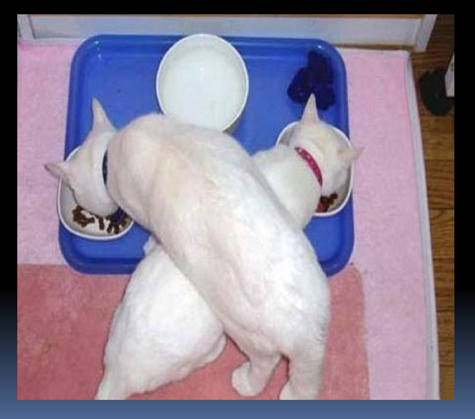
Pam Firth Dec 2011