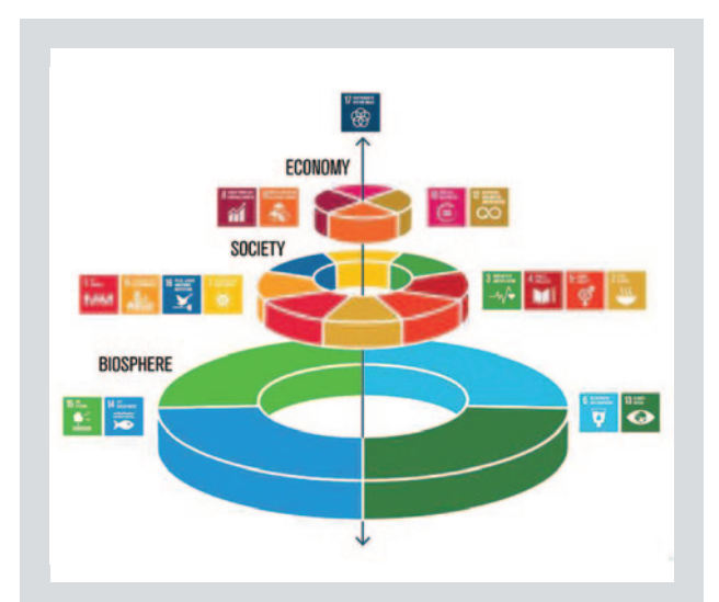
Image credit: Wedding Cake: The Sustainable Development Goals for 2030 can be linked together economically, societally and ecologically. (Illustration: J. Lokrantz/Azote for Stockholm Resilience Centre.)

Collectively, the challenge is that we need to work out a way to live that doesn't cause irreversible damage for future generations of life on Earth: this